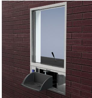
DD-8 transaction drawer with optional bullet-resistant commercial window

DD-8 Transaction Drawer is designed to pass small items between the customer and your employee. Built with rugged, high-performance stainless steel exterior for maximum security. Perfect for prescription containers and other small items.