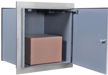
PRS-2 package pass-thru unit

Hamilton's Package Pass-Thru Units accommodate safe and secure transfer of large packages through a wall. Interlocking mechanism automatically locks one door while the other is open, keeping both parties safe.